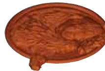
Fur detail added