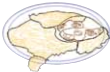
2D vector drawing

Quickly create a full 3D sculpture from your 2D artwork by picking elements of your flat art. Mastercam Art "puffs up" the artwork using a cross section you control. Add or remove one section from another, and easily modify the model by eye to make sure it's exactly what you want. Mastercam Art's various application styles let you add, subtract, intersect, and blend multiple organic shapes. Test a variety of dramatically different looks simply by choosing various application styles for each shape and regenerating the model to achieve your desired look.