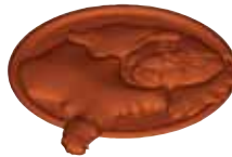
Facial detail added