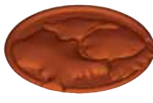
Puffed up base